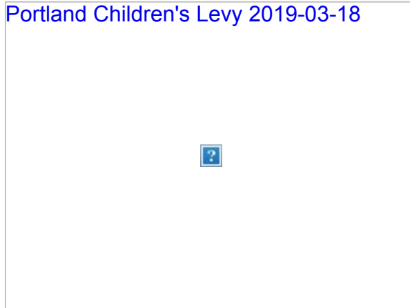
Portland Children's Levy March 18th Allocation Committee meeting